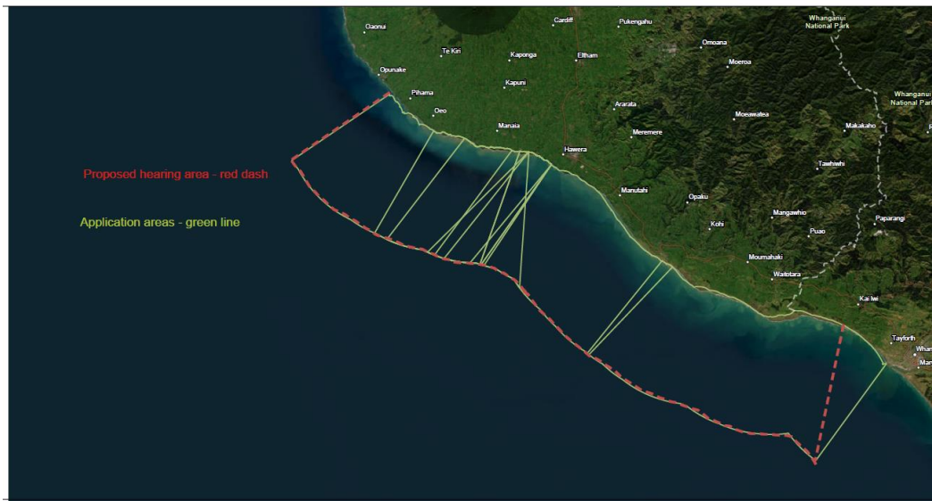
Indicative proposed hearing area - South Taranaki

The South Taranaki Hearing Area was proposed by a Joint Memorandum in February 2023 and allocated by Churchman J on 1 March 2023. 1 The memorandum appended this map showing the hearing area: