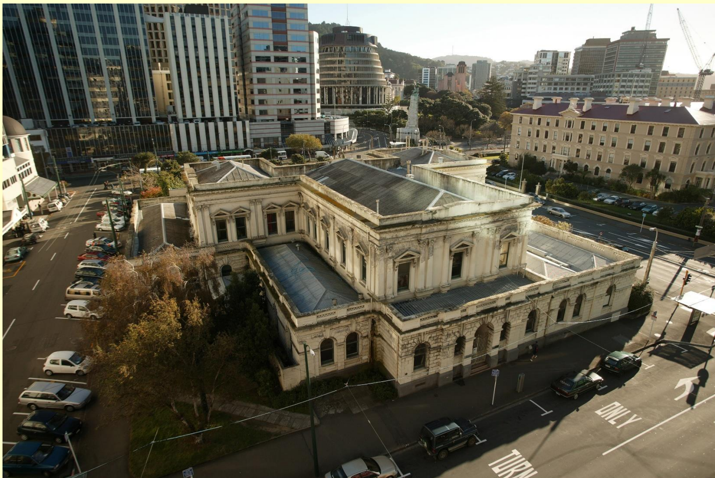
Before the restoration