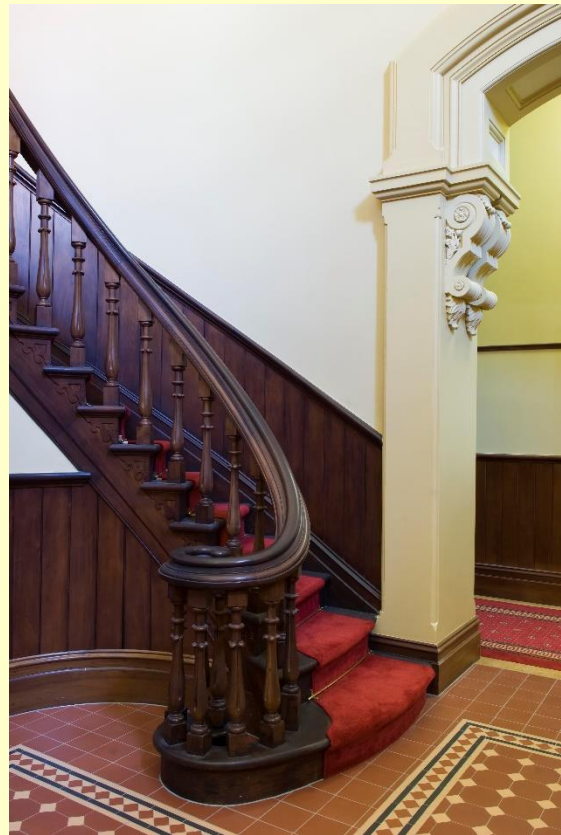
The finished result

The Old High Court reopened in 2010. The office space in the building is now used for staff working for the Office of the Chief Justice. They are responsible for judicial development across all courts, supporting the senior judiciary and for the Courts of New Zealand website. The courtroom is used as a ceremonial courtroom for Wellington.