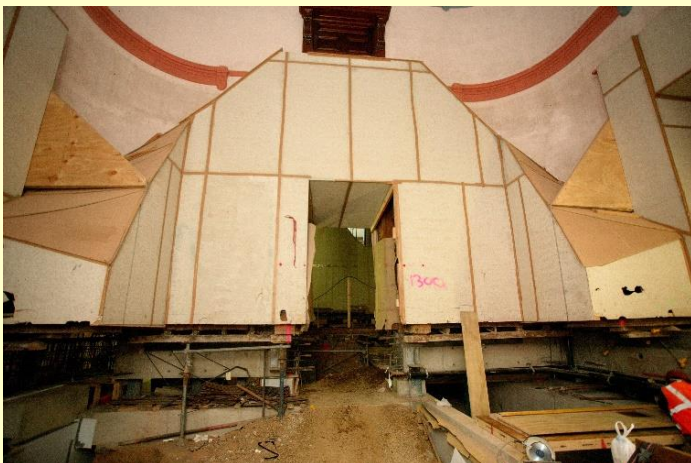
Public foyer – during the restoration and after

While the structural work was completed, care was taken to protect the kauri and rimu timber staircase and wall panelling.