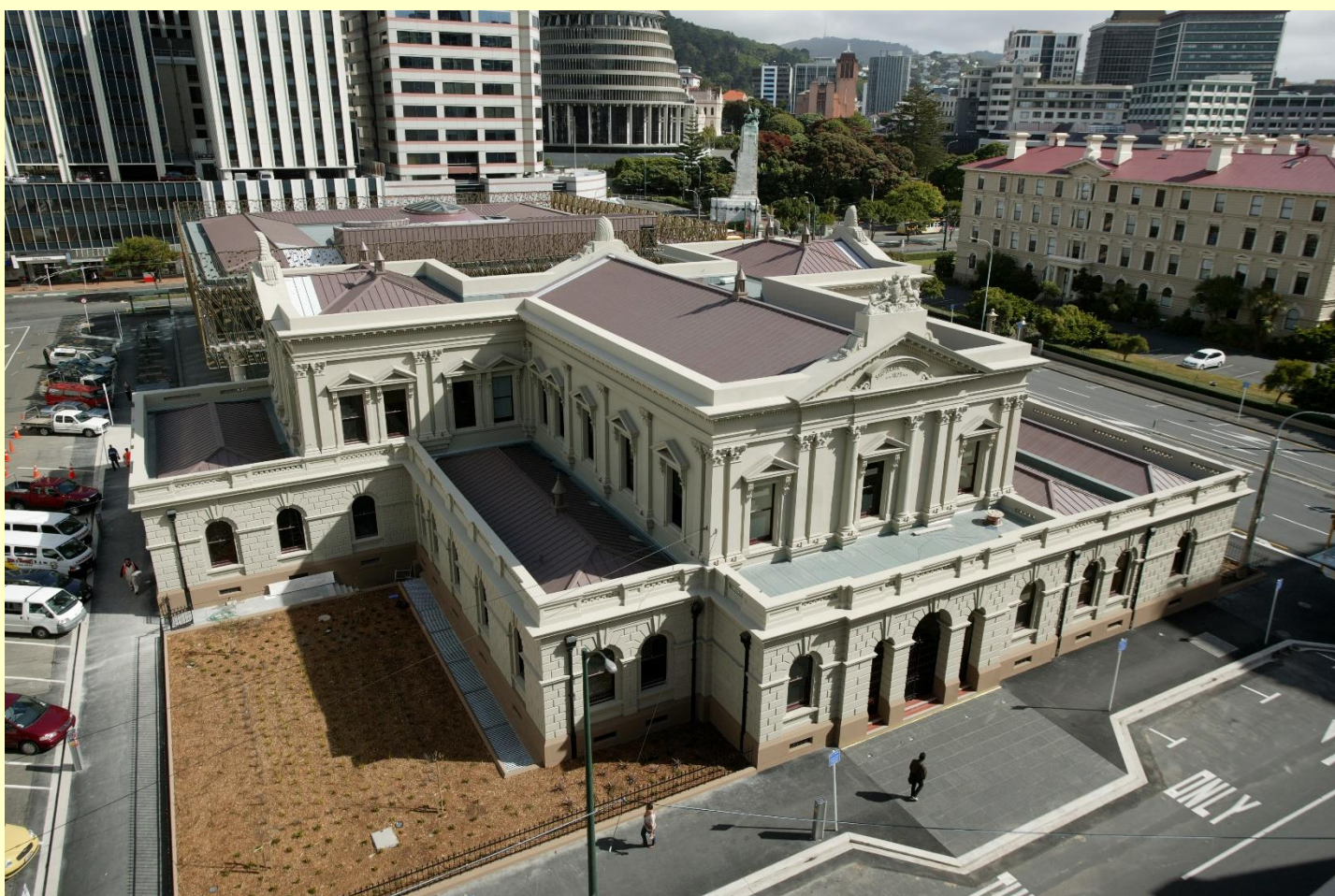
After the restoration