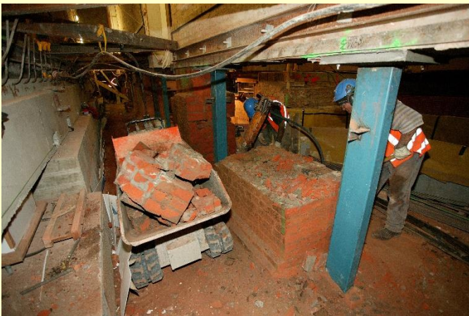
Removing the old foundations

To help the building absorb the swaying and shaking of earthquakes, 130 base isolators were installed in between the old masonry structure and its old foundations.