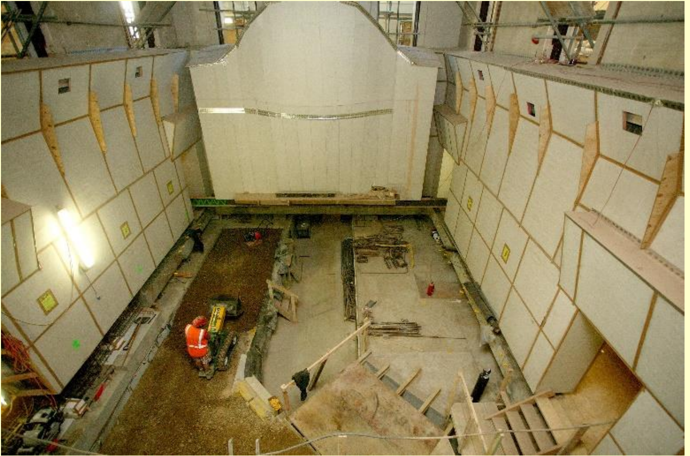
Courtroom No. 1. during the restoration