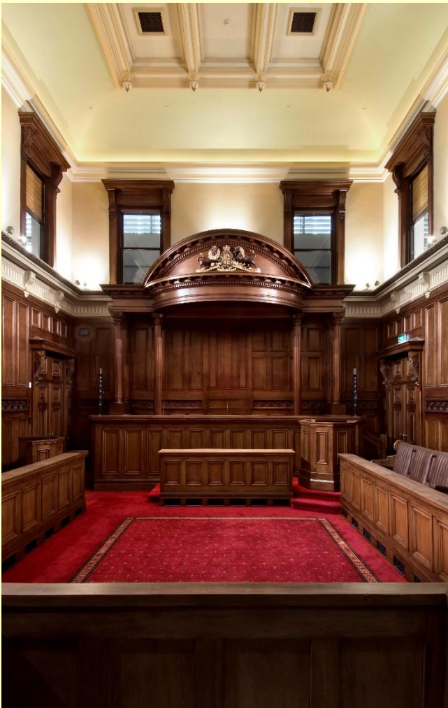
Courtroom No. 1 after